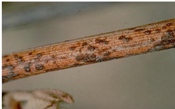
Figure 6. Phomopsis fruiting bodies (pycnidia) in a dormant phase.

The fungus overwinters in lesions or spots on old canes infected during previous seasons (Figure 6) and requires cool, wet weather for spore release and infection. The fungus produces flask-shaped fruiting bodies called pycnidia in the old