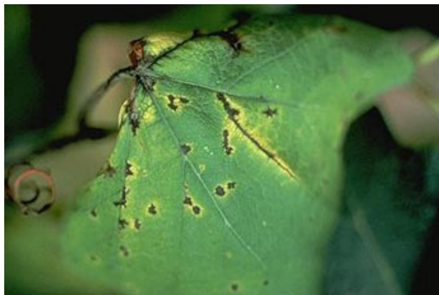
Figure 3. Symptoms on older leaves late in the season.

growing season. Lesions developing on the first one or two cluster stems (rachises) on a shoot may result in premature withering of the cluster stem (Figure 4). Infected clusters that survive until harvest often produce infected or poor-quality fruit.