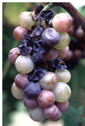
Figure 5. Symptoms of fruit infection.

If not controlled early in the growing season, berry infection can result in serious yield loss under the proper environmental conditions. Berry infections first appear close to harvest as infected berries develop a light-brown color (Figure 5). Black, spore-producing structures of the fungus (pycnidia)