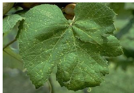
Figure 2. Symptoms on young leaves early in the season.

All parts of the grape cluster (berries and rachises or cluster stems) are susceptible to infection throughout the growing season; however, most infections appear to occur early in the