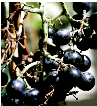
Figure 4. Symptoms of rachis infection.

growing season. Lesions developing on the first one or two cluster stems (rachises) on a shoot may result in premature withering of the cluster stem (Figure 4). Infected clusters that survive until harvest often produce infected or poor-quality fruit.