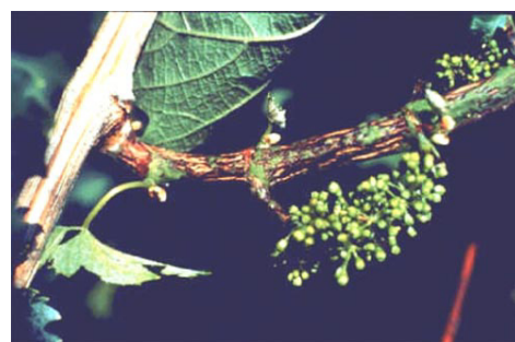
Figure 1. Spotting and cracking of grape cane caused by Phomopsis. These typical cane symptoms are usually present only on the first three to four internodes.

Spots or lesions on shoots and leaves are common symptoms of the disease. Small, black spots on the internodes at the base of developing shoots are probably the most common disease symptom. These spots are usually found on the first three to four basal internodes (Figure 1). The spots may develop into elliptical lesions that may grow together to form irregular, black, crusty areas. Under severe conditions, shoots