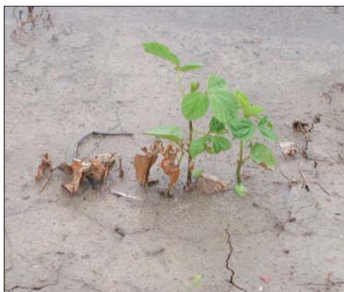
Figure 1. Phytophthora damping off in field.

The disease is most severe in poorly drained soils with high clay content. Traditionally, the northwest section of the state has had severe problems with Phytophthora damping off and root rot. With the