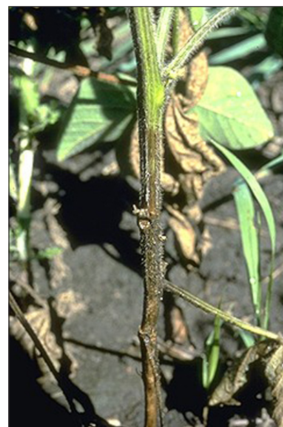
Figure 2. Phytophthora stem rot—adult plant showing stem discoloration.

Phytophthora can attack soybean plants at any stage of development. Symptoms in young plants include rapid yellowing and wilting accompanied by a soft rot and collapse of the root. More mature plants generally show reduced vigor and may be gradually killed as the growing season progresses. Foliar symptoms